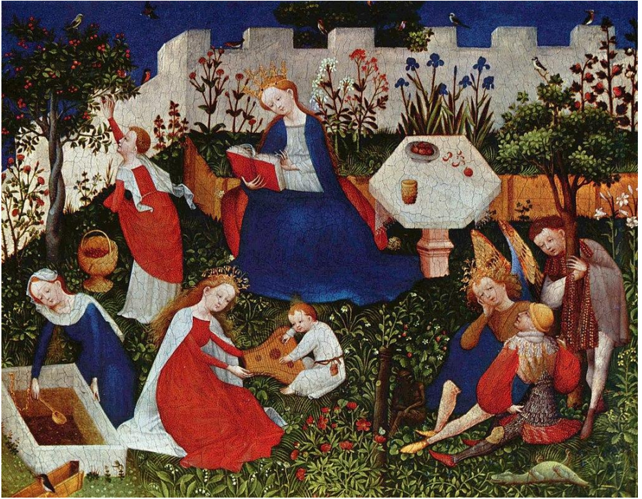
Upper Rhenish Master, The Garden of Paradise , c. 1410

Here we have a 15th century painting from Germany showing a walled garden with Mary seated in the center reading a book. It is the garden of paradise. The figures surrounding Mary are an allegory for a complete, earthly paradise. The infant Jesus is at her feet playing a psaltery (a stringed instrument related to the zither) which is held by St. Cecelia, patron saint of music. To the left we have St. Dorothy, patron of love, midwives, florists, brewers of beer, gardeners and newlyweds, who is picking cherries— a symbol of the sweetness of a life marked by good deeds. Just below her St. Barbara, patron of architects and artillery (her father was struck by lightning after he beheaded her) ladles some water out of a well. On the right, St. Oswald, the saintly king of Northumbria, leans in to hear a conversation between Archangel Michael and St. George (note the dead dragon below them).