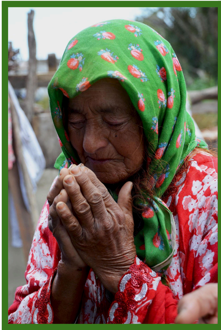
Image: "Gratitude Prayer" Sapha Bouamara, CC BY-SA 4.0 via Wikimedia Commons