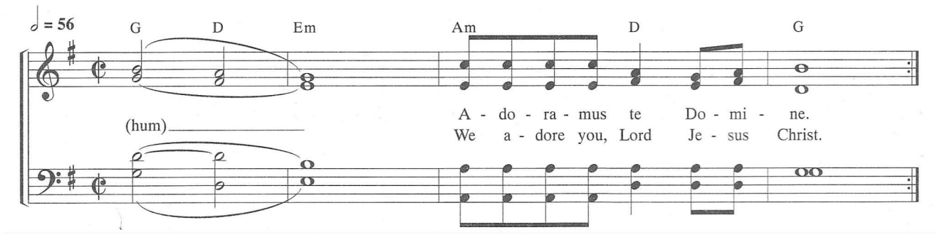
Ateliers et presses de Taize / OneLicense