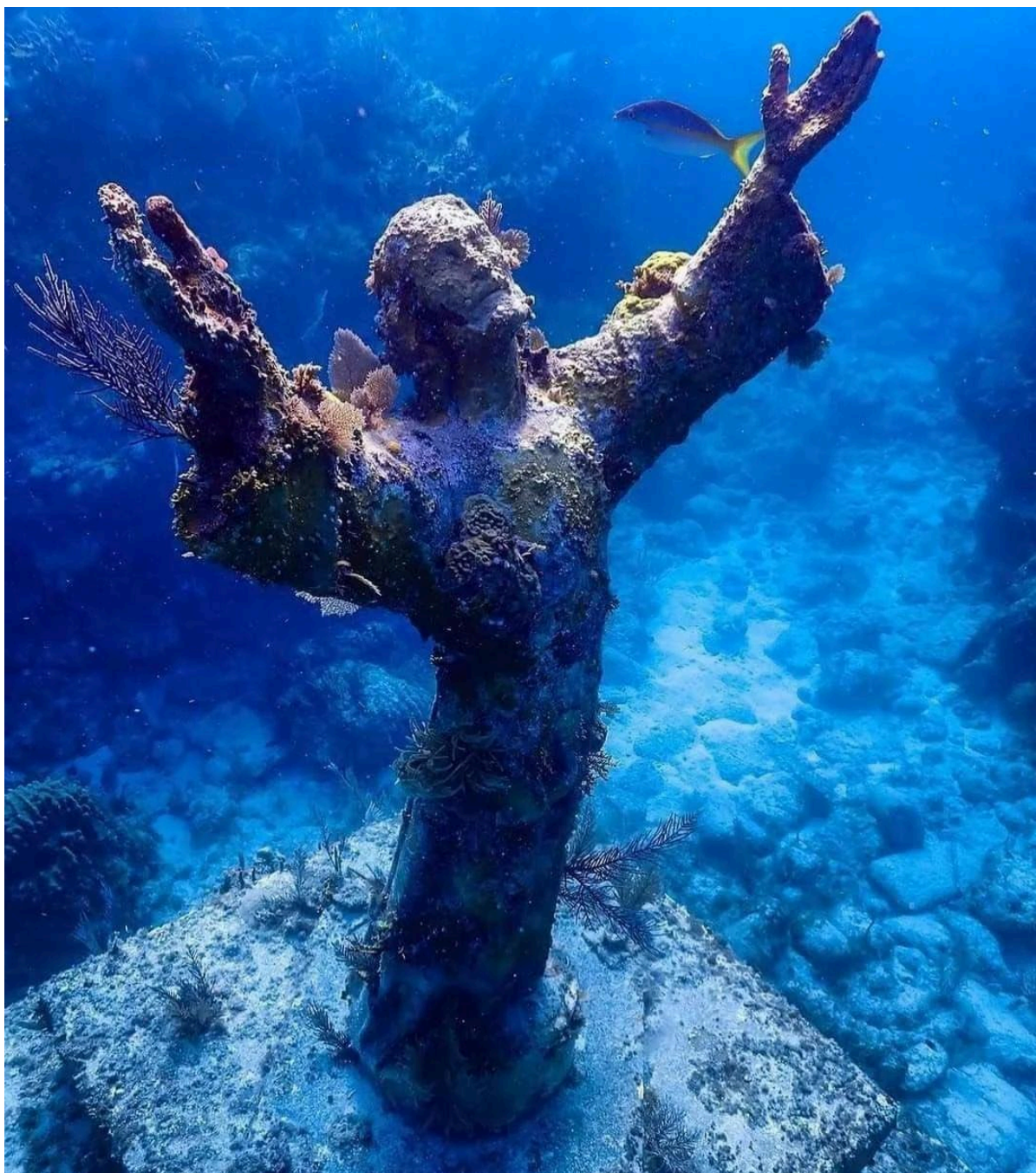
Images: (front) Christ of the Abyss, statue by Guido Galletti / (back) Trinity Icons - support the artist.