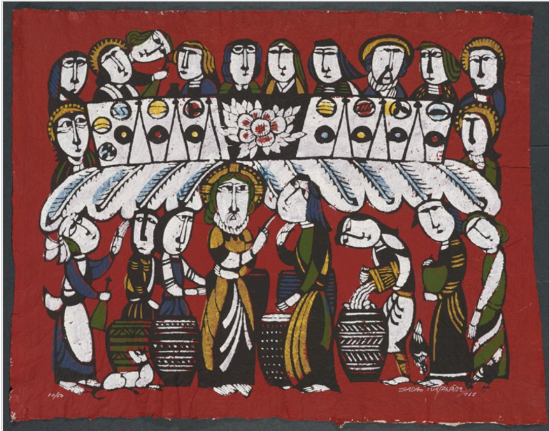
Sadao Watanabe "Wedding at Cana." (1968)