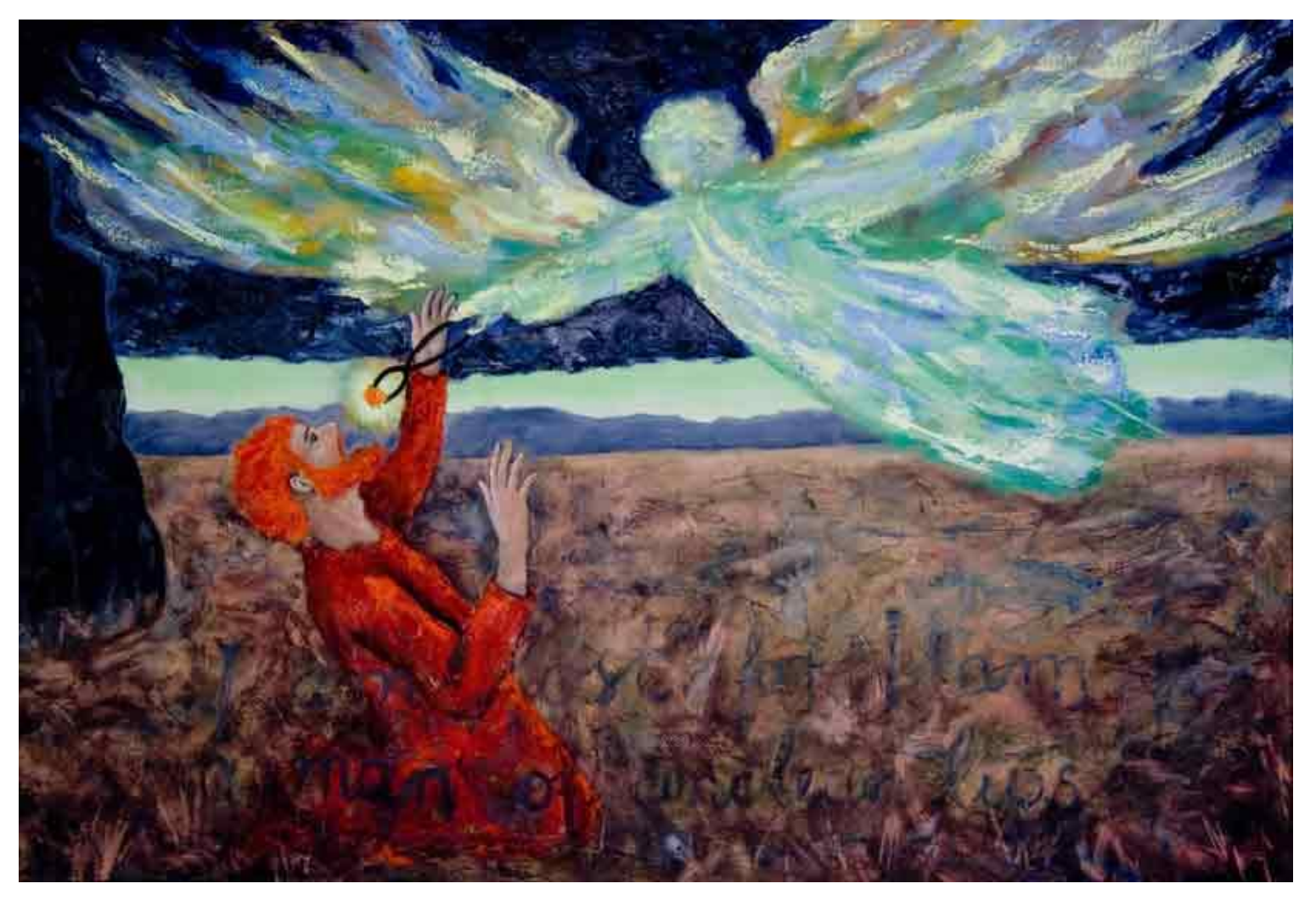
The Call of Isaiah - Source / artist unknown