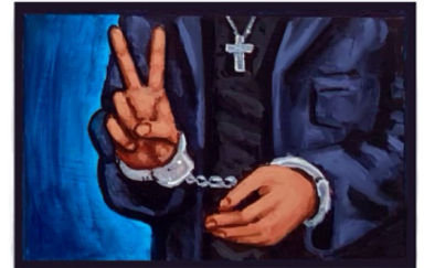
Image: The Beatitudes , by Kelly Latimore. https://kellylatimoreicons.com/en-ca